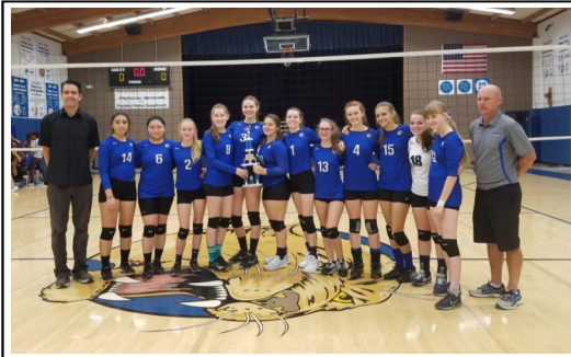
PAA Varsity Volleyball Team

This week, a group of 50 PAA students, teachers, and parents will travel to Walla Walla University to participate in the Fall Classic Sports Tournament . This event is a highlight each year for both volleyball and soccer, and offers