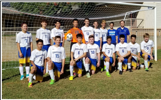
PAA Soccer Team

students an excellent opportunity to build their athletic skills both as individuals and as teams. In addition, it strengthens their friendships with one another and provides opportunities to make connections with students from other schools. It also allows the students to visit the WWU campus which has been instrumental in many students' decisions to attend WWU. Finally, Sabbath is a great opportunity to participate in Vespers and Church Services. Please pray that these few days will be times of safety and of growth in all aspects—physical, mental, social, and spiritual.