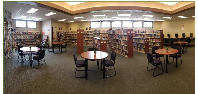
The library is fully clean and ready for students