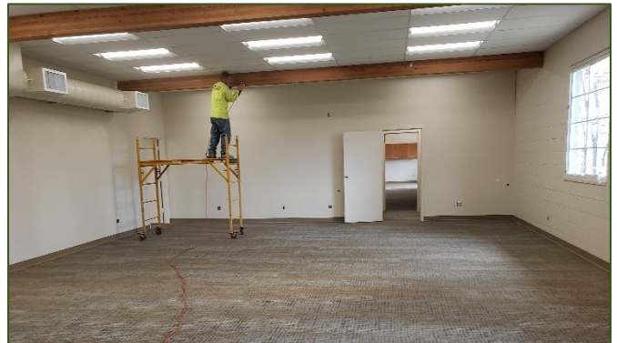
The elementary classrooms are nearing completion