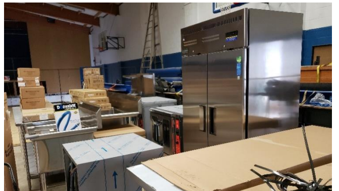
These new kitchen appliances will soon find a new home in our school kitchen