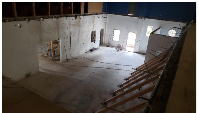
The current view of the basement shop from the gym floor